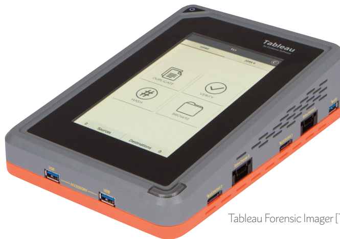
Tableau Forensic Imager [TX1]